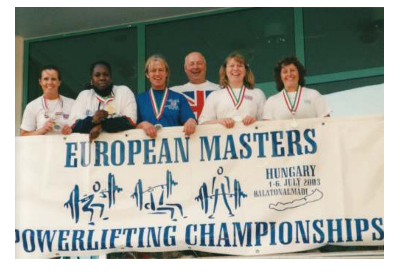
Oh yes, I also invented the semi-sumo position in Dead Lift!!