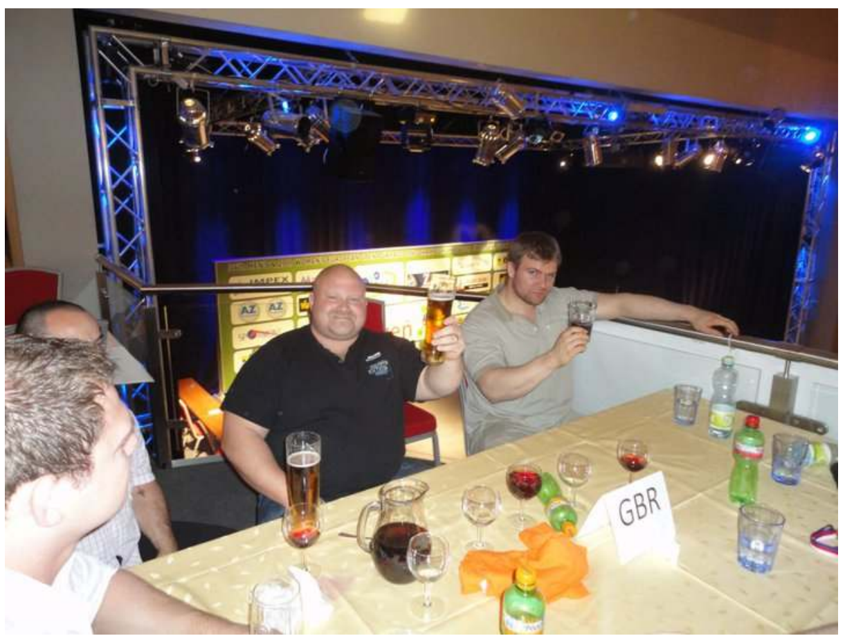
Roll on the World's in November and hopefully another report from me....