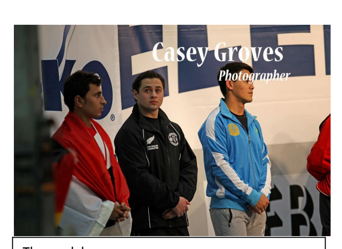
The medal ceremony.....