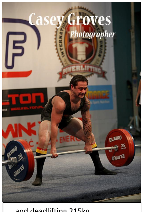
...and deadlifting 215kg