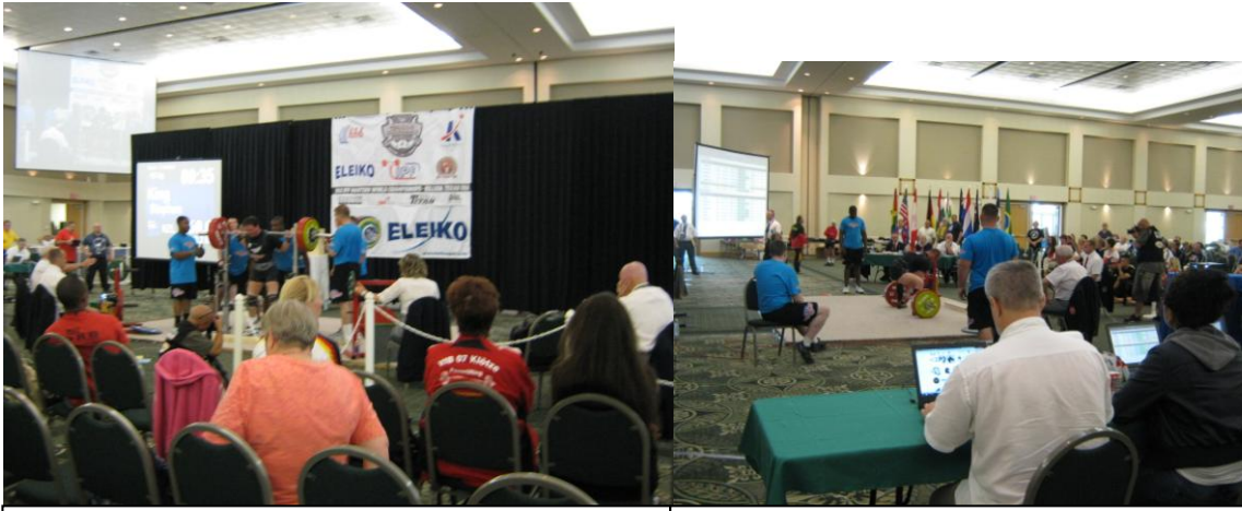
The big Kingi cranks up 260kg to grab the bronze medal