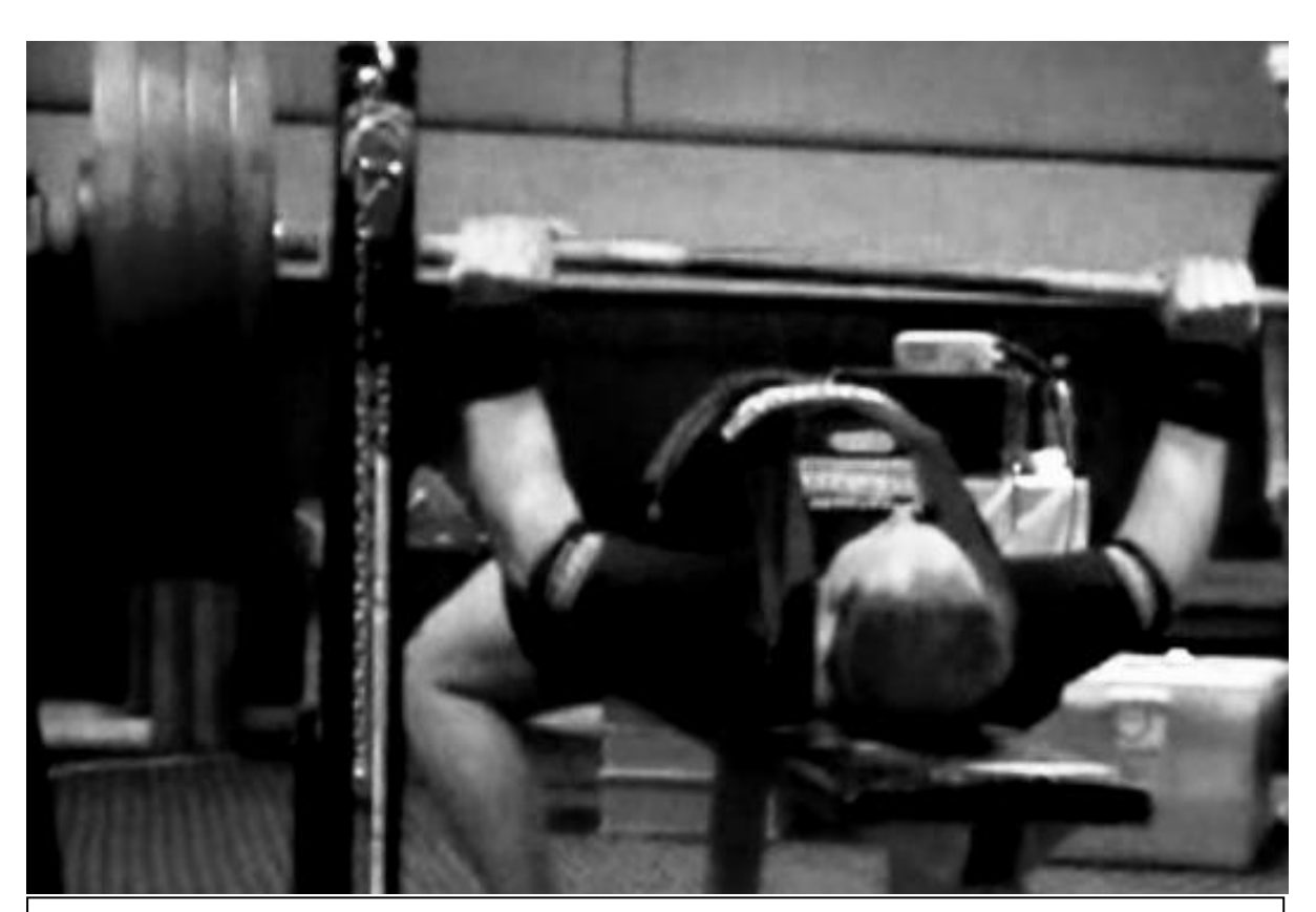
By far Leighton's best lift and proof of how well you can make a shirt work for you