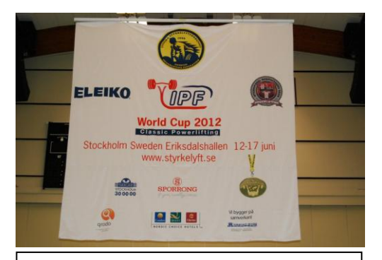
The Inaugural Raw World Cup 2012