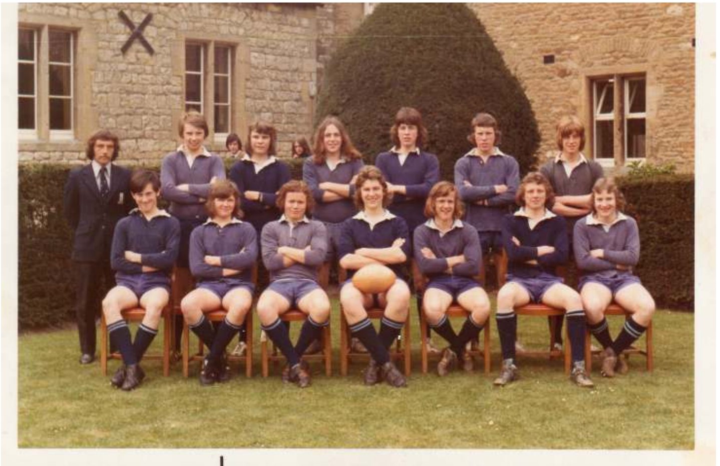
Summer 1974 – Magdalen College 2 nd XV (Front row 3 rd in right – dig the hairstyles!!)

The best thing about being at boarding school was that at the end of each day there was little else to do other than sport and I threw myself into rugby, cross country, athletics and gymnastics all of which I enjoyed except the cross country. My enthusiasm for rugby was tempered for a while after I nearly died on the pitch during a house match in which my brother was also playing – a kick to the head sent me into a concussion fit and I choked on my tongue, stopped breathing and had to be given the kiss of life (a very dangerous thing at boarding school). The match was abandoned, I was carried off on a stretcher and was unconscious for over 2 hours and rugby was never quite the same for me again.