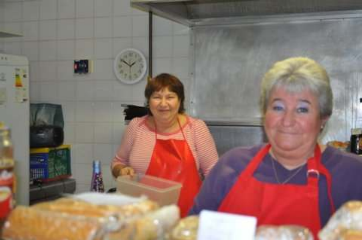
Oooo no we don't like them two Fat Ladies – we're more like the Hairy Bikers!!