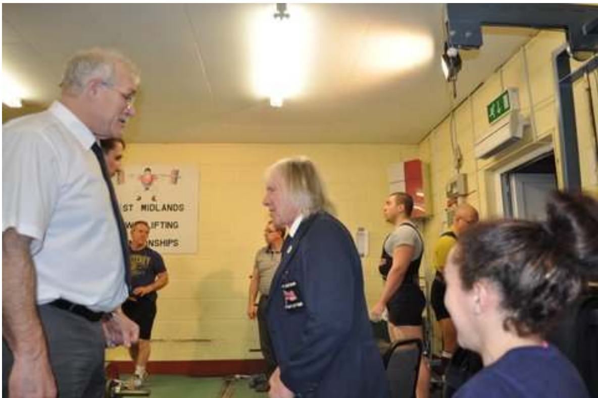
Now look for the last time Sonny - you got any ID???