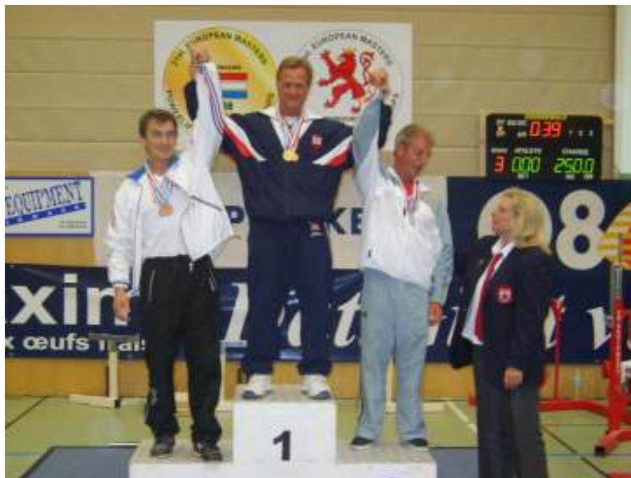
European Masters 2 Luxembourg 2008