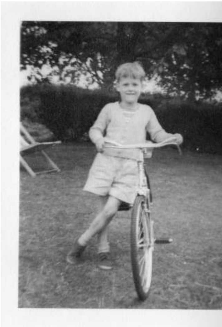
3 stone of skin and bone!!

I had no idea in my early years that I would get involved with any kind of sport involving weights, indeed I was such a diminutive little oik that my mother took me to the doctors when I was nine to see if there was any reason I was so small. He thought not but still put me on a course of liquid malt and vitamin C tablets (the malt was actually quite tasty compared to the other vile things like liquid liver which I took voluntarily later on in my sporting life).