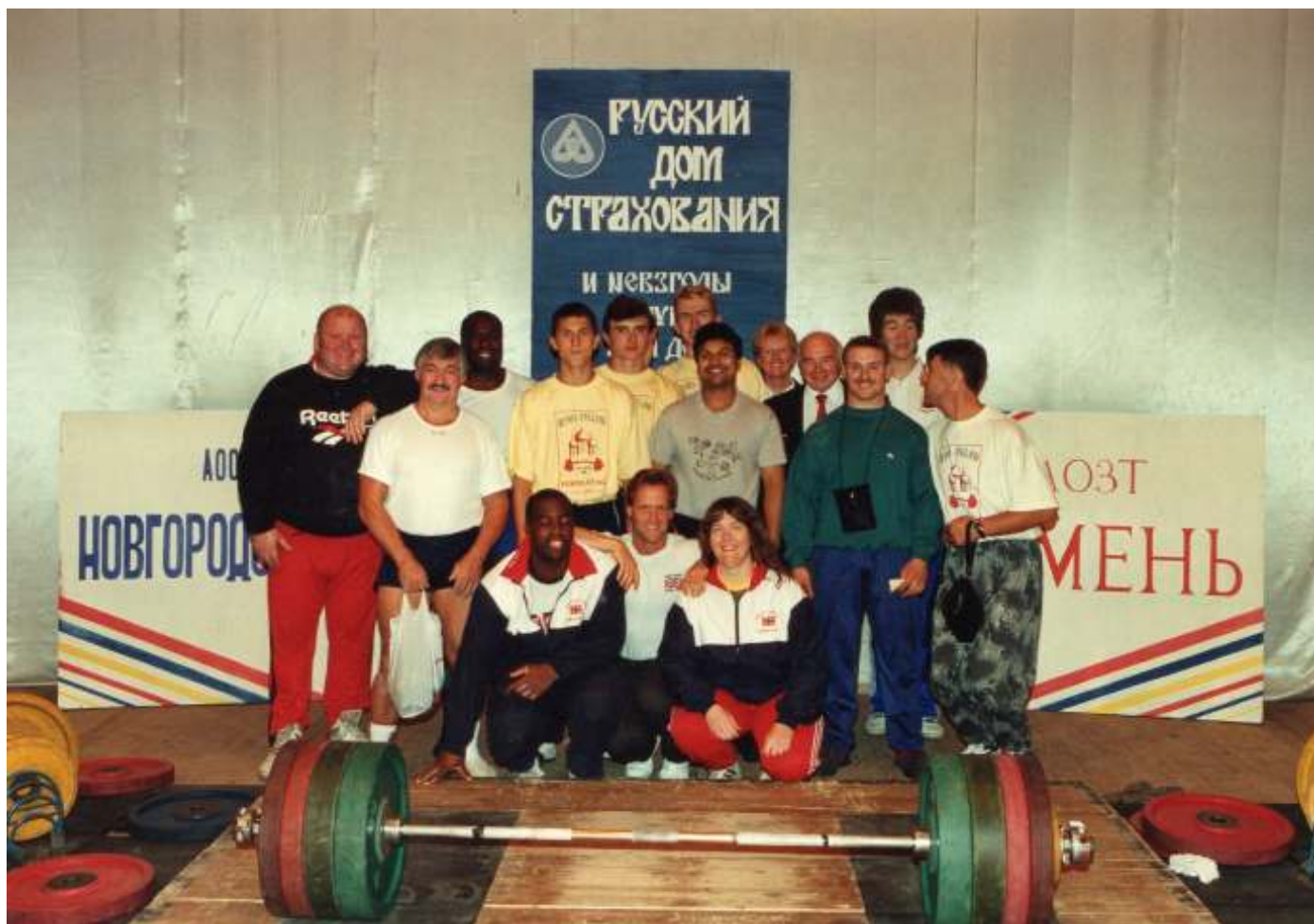
Novgorod Russia 1994 – my first trip – Russia v England Friendly – Vodka all the way!!

The equipment we were often presented with was at times almost archaic – smooth chromed bars with no knurling left, constant power cuts and on one occasion stands that were too high so that short lifters had to stand on a box to squat however in spite of such things (or maybe because of them) I have many happy memories of trips to Russia, Argentina, America, Lithuania and many other places that I would never have been lucky enough to see if it wasn't for the lifting.