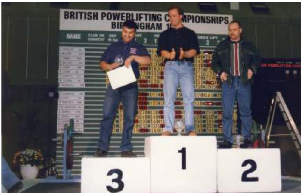
1996 British Champion again after 8 years of trying

After that for the next few years, I placed several times always close to my old mate Jas Singh but I didn't win again until 1996 in Birmingham and then won every year from 1998 to 2002 and for the last time in 2006 at 50 years old with a 680kg total – 8 titles - always at 75kg class.