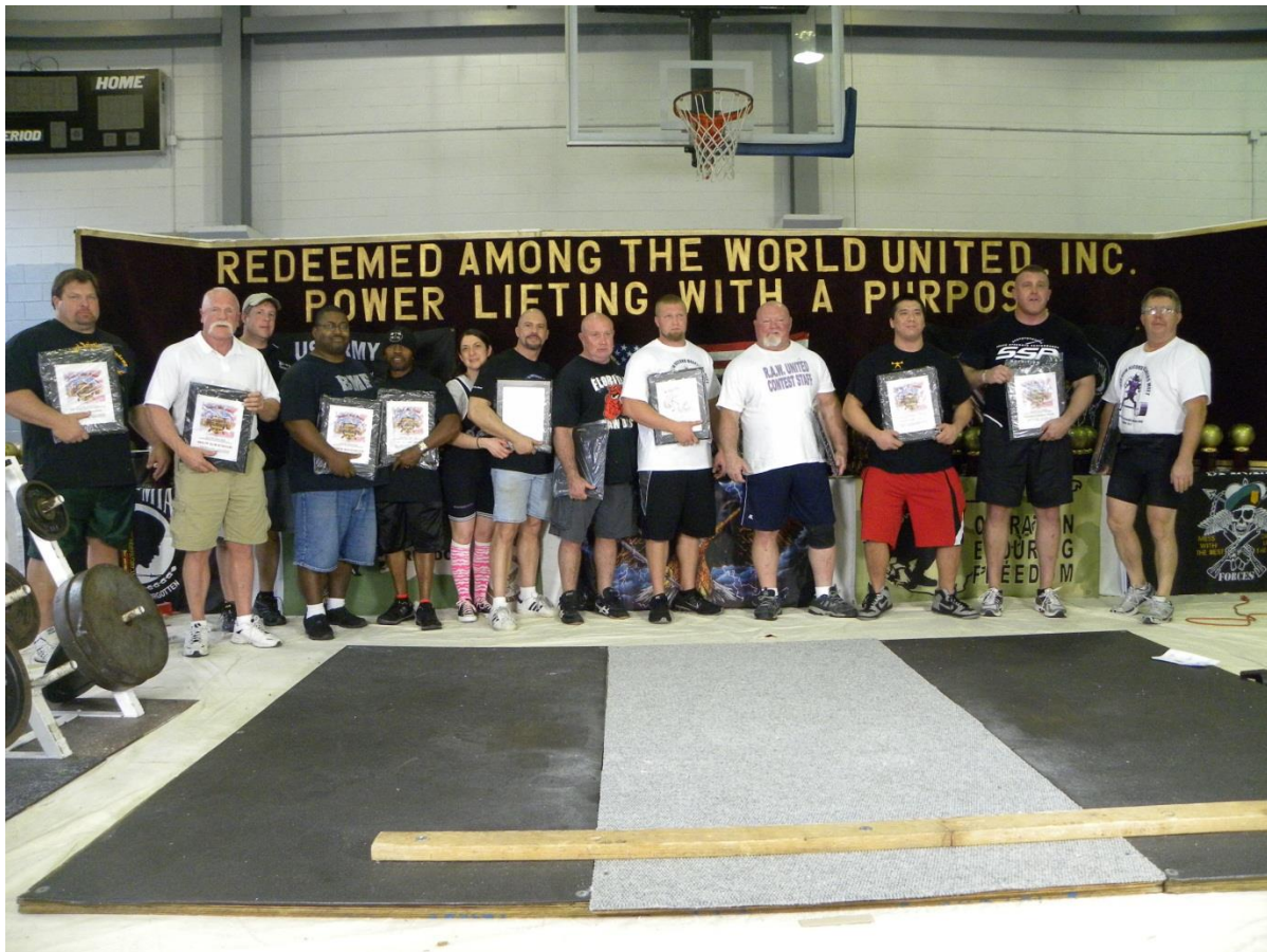
Service Awards at the RAW Record Breakers Meet honoring lifters that served as judges, spotter/loaders, etc. throughout the 2012 powerlifting season