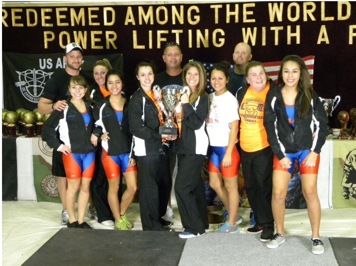
Above: The girls from Ridgewood High School in Port Richey, Florida rocked the platform at the 2013 RAW Record Breakers Meet!