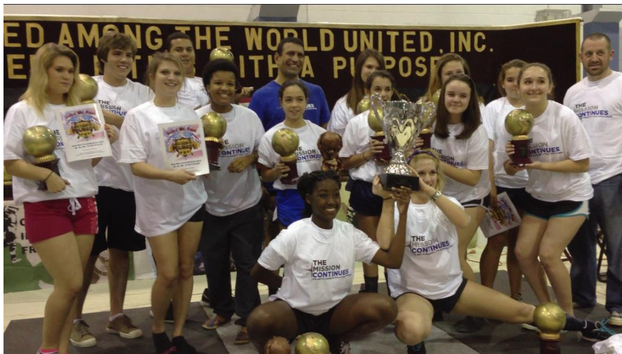
Wildcat Powerlifting captured the Overall Women's Team Title at the 2013 RAW Record Breakers Meet!

The Wildcats are currently being supported through a Fellowship granted by "The Mission Continues," a veteran's service organization that promotes community service projects.