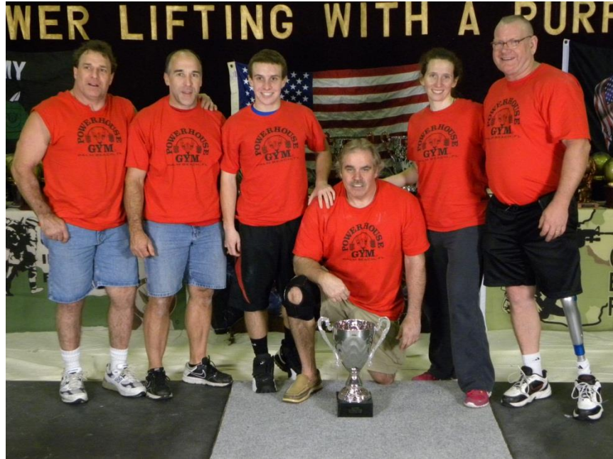
Above: Team Powerhouse from Powerhouse Gym in West Palm Beach, Florida