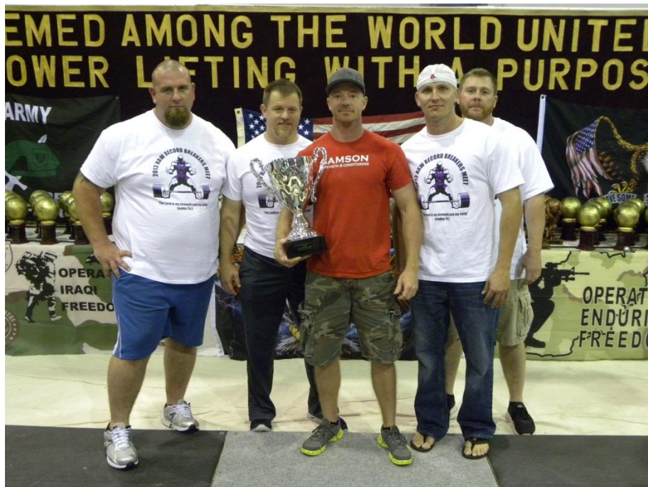
Below: Samson Strength & Conditioning in Port St. Lucie, Florida