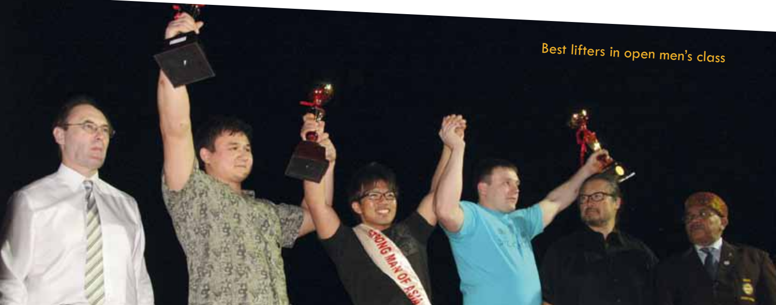
Best lifters in open men's class

The lifters in the Asian Classic Championship were a mixture of novice and veteran raw lifters. For example, Japan has held unequipped powerlifting competitions for some 17 years and unequipped bench press championships for 13 years. Because Japanese unequipped lifting is very competitive, only the top lifters from the Japanese Nationals could represent at the Asian Classic Championships. I imagine that Kazakhstan also has some history of unequipped competitions. Kazakhstan and Japanese lifters are very competitive and if they compete at the World Classic Championships they will get a good position. For me, it looks like some countries are just beginning with raw competitions. But once they start, they will continue to experience the benefits and soon all the lifters will show a high level of competition.