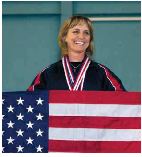
'I consider it an honor and privilege to compete in the IPF. I have been able to travel the world and make friends of many nationalities.'

go!" My faith in the Lord gives me confidence and hope for greater things. Late in 2003 I had a bulging disc in my neck and was told I should consider surgery and give up powerlifting. I will admit, the first thing I asked God was, "Why?" The next thing I did was pray to Him that He would get me through rehab, teach me whatever lesson I could learn, and give me the courage to persevere and become stronger than I'd ever been before. Praise the Lord, He answered my prayers and almost ten years later, I am competing, enjoying myself, and stronger than ever.