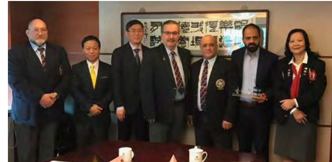
Gaston Parage IPF President

With the support and approval of Chinese Olympic Committee, International Powerlifting Federation paid a visit to Chinese Weightlifting Association on Feb 2, 2018 to discuss the future development of Powerlifting in China.