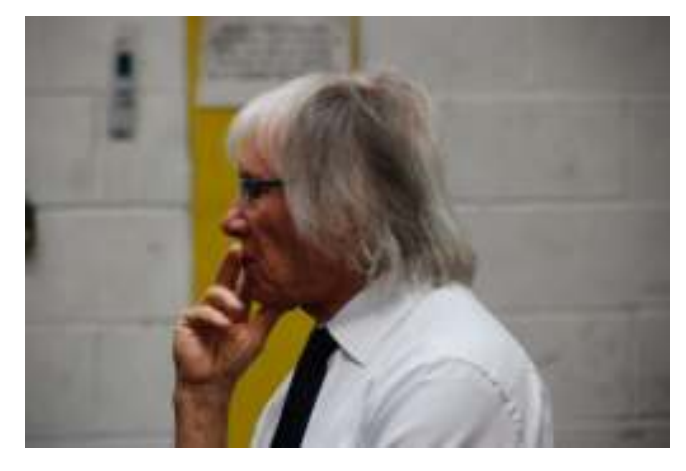
10.30am - I'll give it till 10.45am