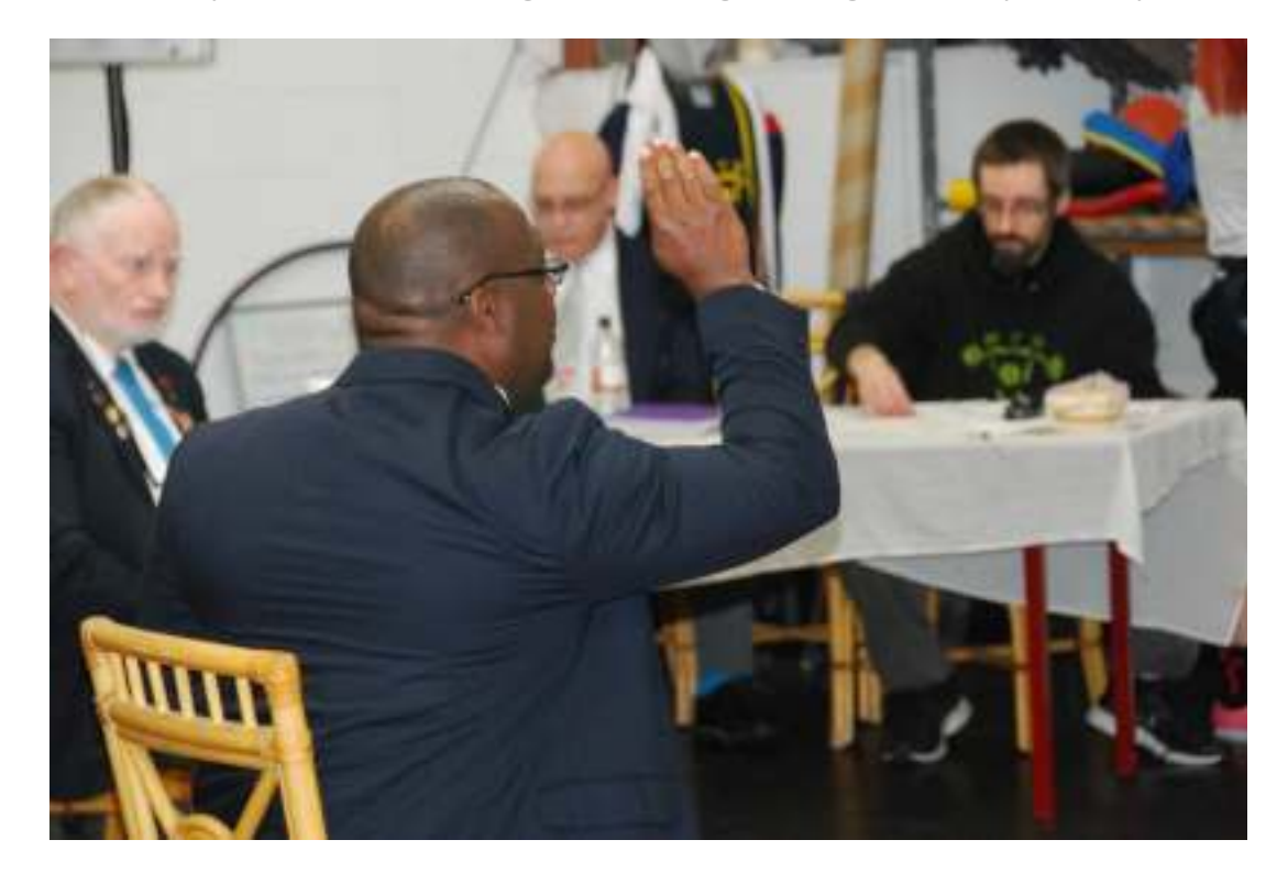
The "Double top to win" manoeuvre