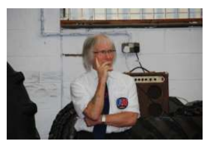
10.00am - Maybe I should stand somewhere else