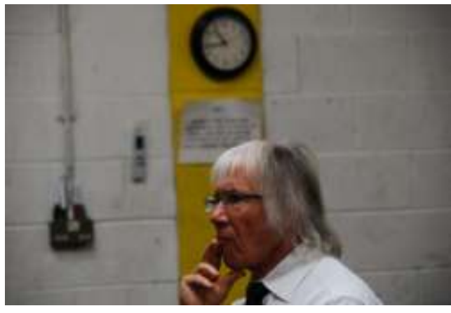
10.45am - If only there was a bloody clock in here!!