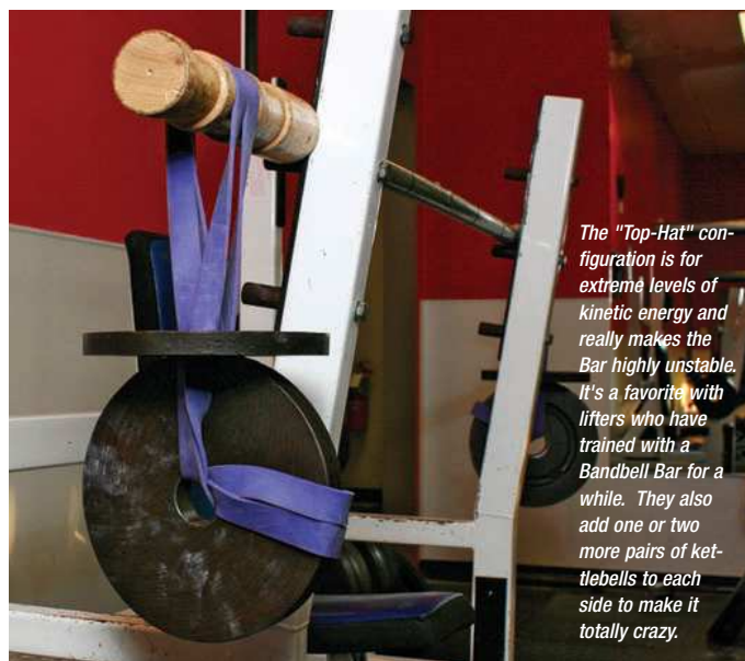
The "Top-Hat" configuration is for extreme levels of kinetic energy and really makes the Bar highly unstable. It's a favorite with lifters who have trained with a Bandbell Bar for a while. They also add one or two more pairs of kettlebells to each side to make it totally crazy.

When I was training injured, I used to do power movements like boards, chains, floor presses, etc., using only a partial range of motion to protect the area. It happens slowly, but you lose sight of the fact that you are no longer comfortable with max-weight workouts and heavier weights in general. But with healthy shoulders and good technique, I got comfortable and aggressive with the bigger