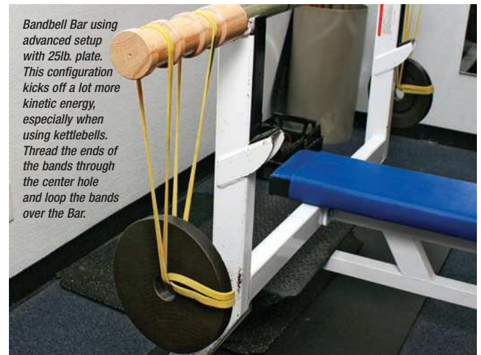
Bandbell Bar using advanced setup with 25lb. plate. This configuration kicks off a lot more kinetic energy, especially when using kettlebells. Thread the ends of the bands through the center hole and loop the bands over the Bar.

Not long after the shoulder started feeling better, I wanted to add a lot more weight to see what this bad boy could do. But here's where the bar steps in and says, "Not so fast, dude! You need to fix a few things first." Hell, I didn't know anything was wrong, but the cold, hard reality is that as the weights get heavier, the bar begins to expose and pinpoint any weaknesses you have failed to correct. I saw this over and over again at this year's Arnold Classic Expo. There were literally hundreds of guys who were trying the Bandbell