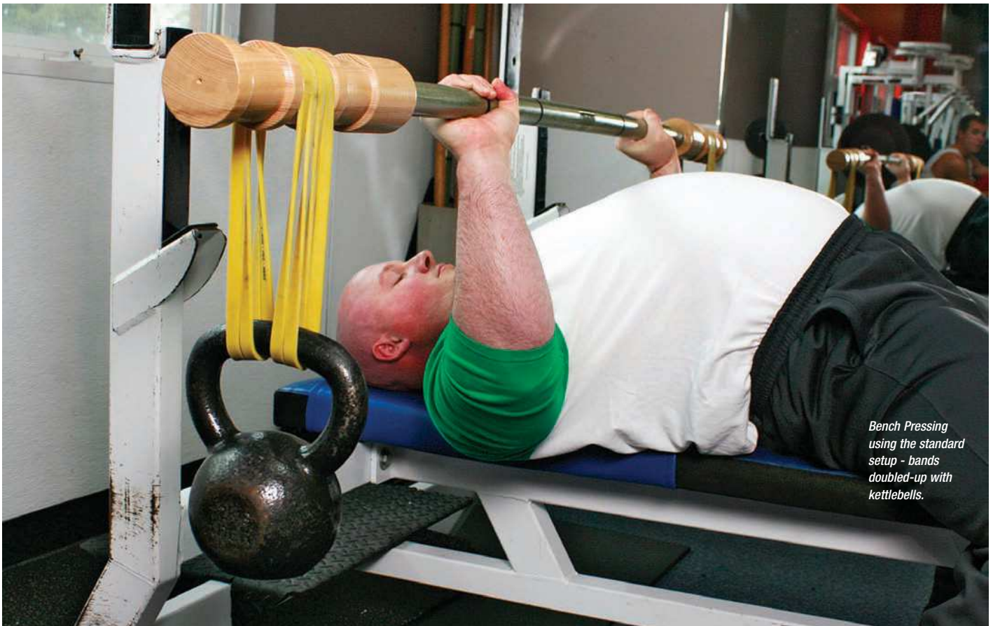
Bench Pressing using the standard setup - bands doubled-up with kettlebells.

S queeze the bar. Drive your feet into the floor. Pull your shoulder blades together and remember, stay tight! I'm sure these are just a few of the phrases everyone hears from their training partners when they are under the bar getting ready to bench. I know they're right, but it's easier said than done when the weight really starts to get up there.