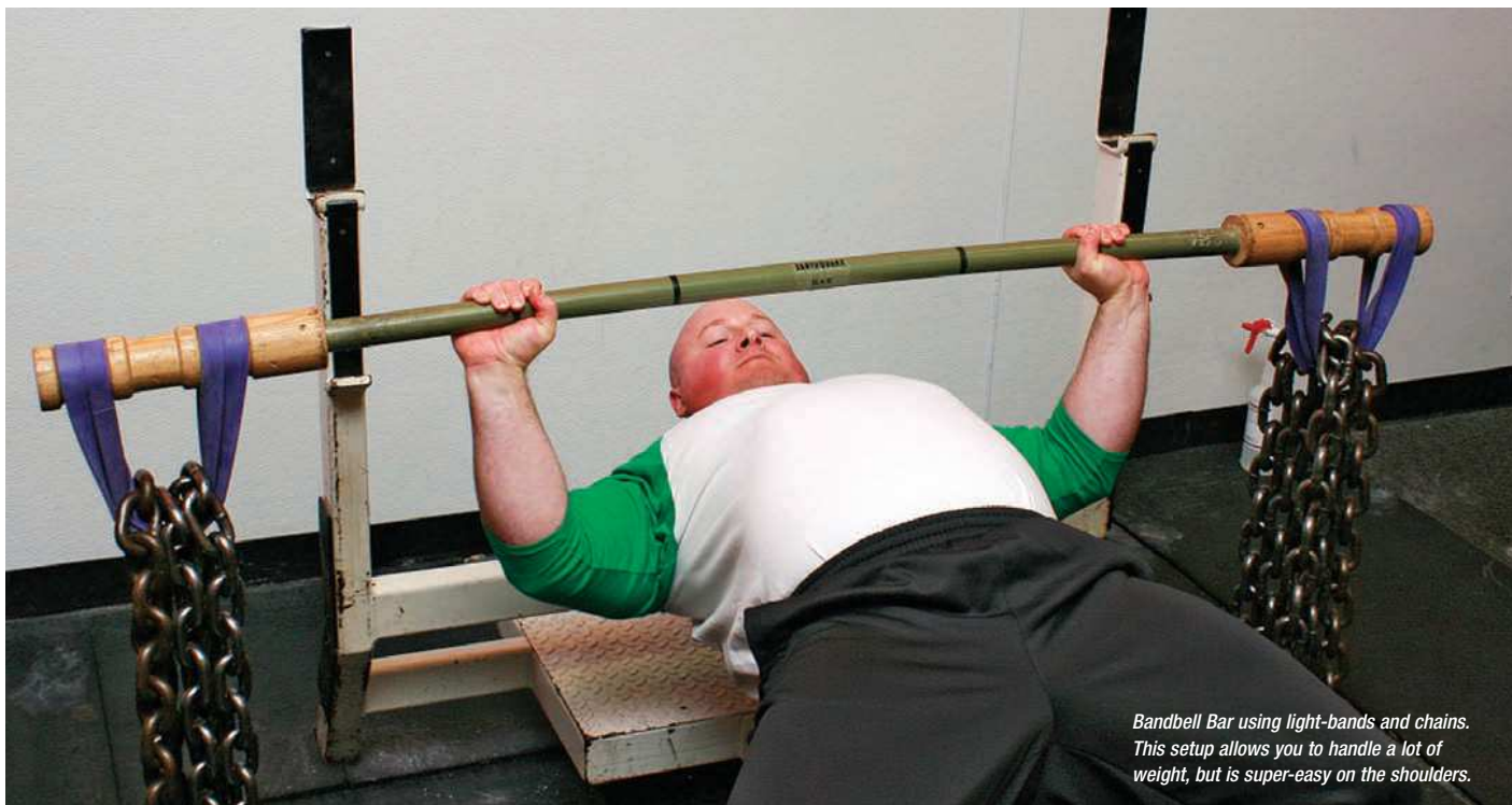
Bandbell Bar using light-bands and chains. This setup allows you to handle a lot of weight, but is super-easy on the shoulders.

Bar for the first time, some of them seriously strong benchers, but you could see technique problems come to the surface right away. How do you explain to someone, in 30 seconds, what's happening and what can be done to fix it?